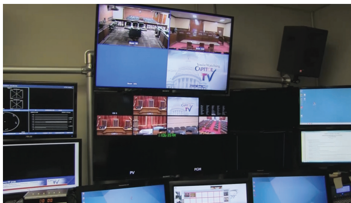
The Capitol TV team encoding live TV for the web

"Our cable TV schedule made it difficult to broadcast all live sessions and also make replays and interviews available during the hours when citizens wanted to view" said Derek